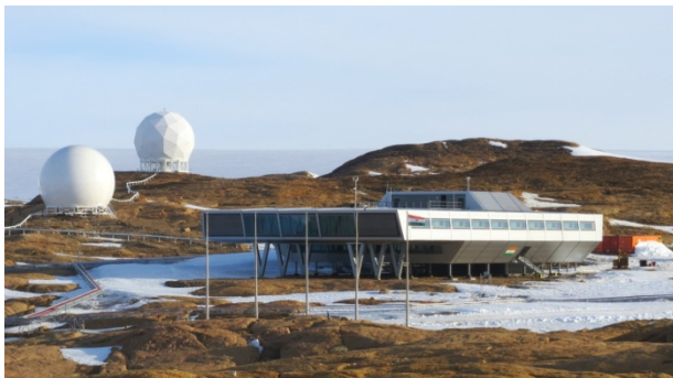
Bharati during austral summers

The main building offers regulated power supply, automated heat and air conditioning with hot and cold running water, flush toilets, sauna, cold storage, PA system, aesthetically designed living, dining, lounge and laboratory space, etc.