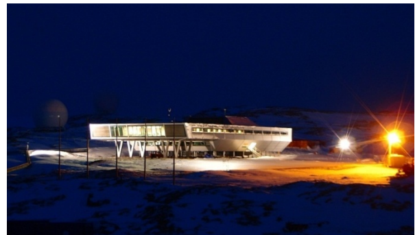
Bharati during austral winters